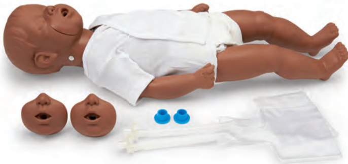
The Pediatric CPR Manikins come fully assembled and ready to use.